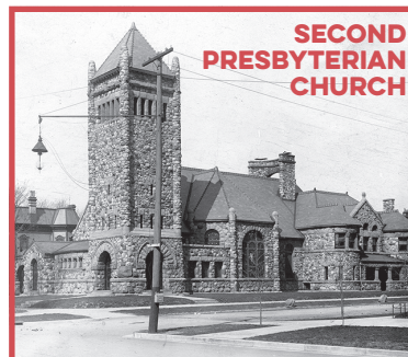
SECOND PRESBYTERIAN CHURCH

In 1887 the congressional members of the Second Presbyterian Church of Peoria elected